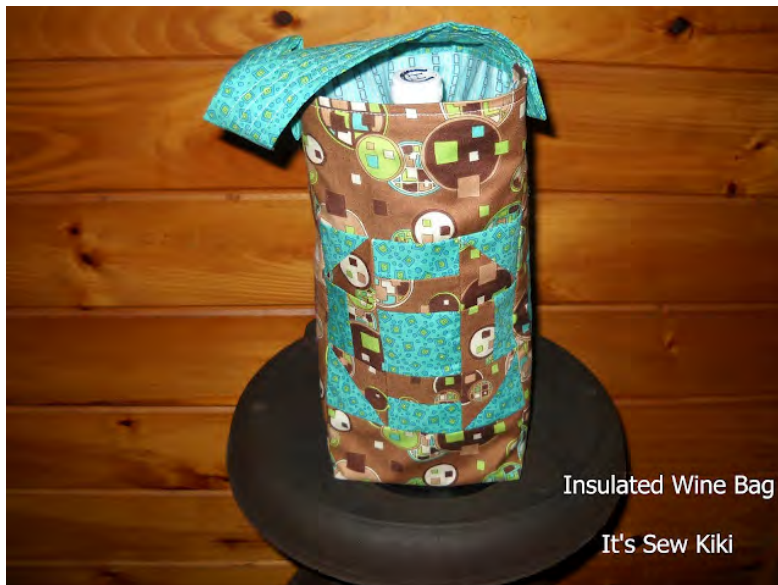
Insulated Wine Bag It's Sew Kiki